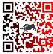
X220 MOISTURE FIX®