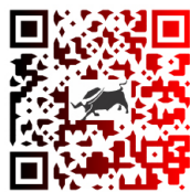
X-20 COOLROOM AND FREEZER