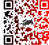
X280 DENSI-PROOF REO PROTECT™