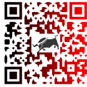
X260 MEDI-VET® (ANTIMICROBIAL)