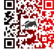
X100 GREEN CURE AND HARDENER