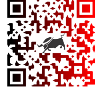
X230 DENSI-PROOF REPELLER™