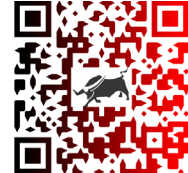
X550 CARPARK WAREHOUSE™