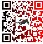
X263 MEDI-VET REPELLER® (ANTIMICROBIAL)